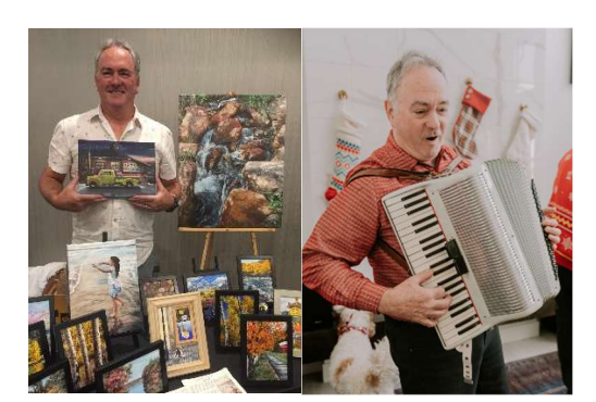
Artist & Musician www.glennieartist.com